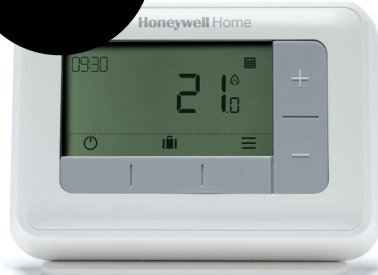
HEATING PACK 2 - T4R HONEYWELL HOME RF 7 DAY PROG STAT