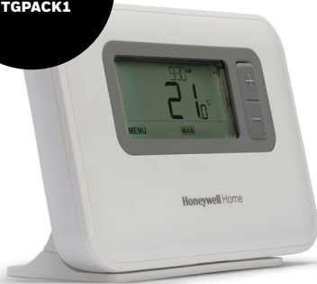
HEATING PACK 1 - T3R HONEYWELL HOME RF 7 DAY PROG STAT