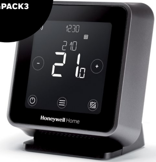
HEATING PACK 3 - T6R HONEYWELL HOME SMART RF STAT